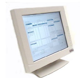
Electronic Mammography Tracking for MQSA